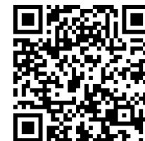
Registrar/Vice-Chancellor Gujarat University